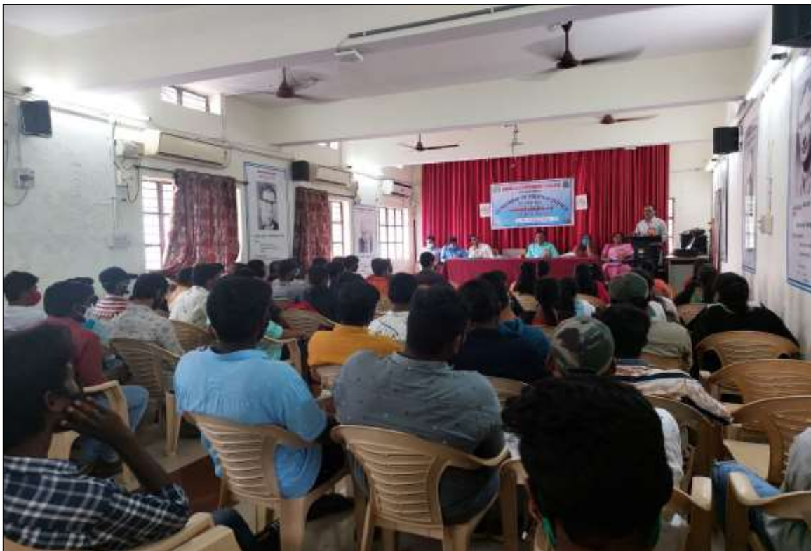
Student’s Participation in the seminar on 10.12.2021